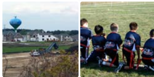
5% will be used for the Community Development Department and the Village parks system