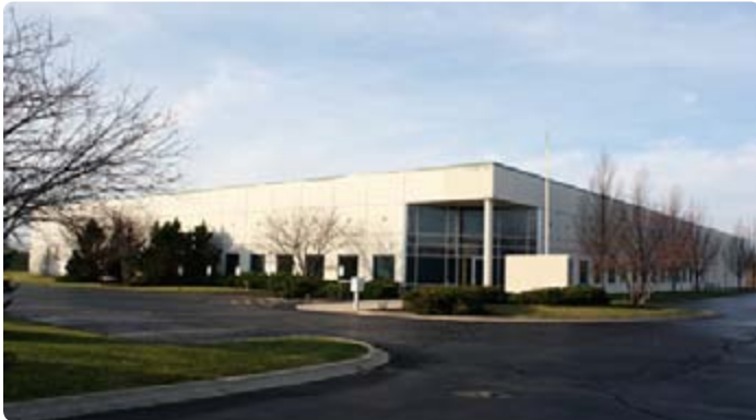
Good Foods Group LLC intends to begin food production at its new Pleasant Prairie location in mid-February.

On Monday, November 12, the Pleasant Prairie Plan Commission considered and approved Site and Operational Plans for Good Foods Group LLC, an all natural food manufacturer of preservative free dips, sides and salads. Good Foods Group has plans to occupy a 56,335 square foot building in LakeView Corporate Park at 10100 88 th Avenue. The Pleasant Prairie location will expand upon the company's current 10,000 square foot facility and additional rented space in Chicago.