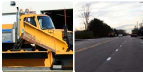
16% will be invested in public works services, such as snow plowing, road maintenance and the like