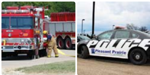
50% will be invested in public safety services, including police, fire and rescue

The majority of 2013 budget dollars (approximately 66%) will be used to provide public safety services, such as police, fire and rescue, and public works services, such as snow plowing, road maintenance, and similar work. The remaining amount (roughly 34%) will be used to: pay down existing debt, finance General Government's day-to-day operations, operate a Community Development Department, and maintain the Village parks. Percentages for each area are shown below (percentages are rounded).