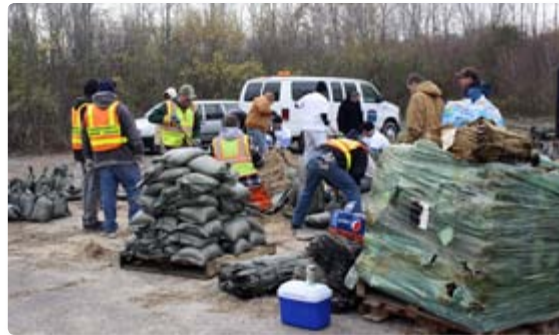
Several volunteers, a crew of County inmates and Village staff worked to fill sandbags to help protect lakefront homes from potential water damage from high waves on Lake Michigan on the evening of October 29 and on October 30.

Around mid-day on October 29, the Village President and staff were notified of a special marine weather forecast by County Emergency Management officials. The forecast indicated that dangerous high waves of 14 to 18 feet were anticipated along the Lake Michigan shoreline in the southeastern most part of Wisconsin. A Village team gathered to discuss how the forecasted conditions could impact the lakeshore area in Pleasant Prairie.